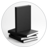
Soft and Hardbound Book Covers