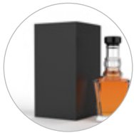
Liquor and Luxury Product Packaging