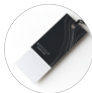
Point of Sale Promotional