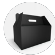
High Use Folding Carton Packaging