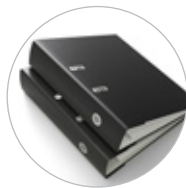
Ring Binders, Media/Binders and Cases