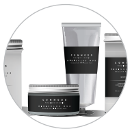
Secondary Cosmetic Packaging