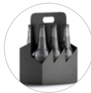
Consumer Goods Packaging