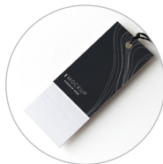
Point of Sale Promotional