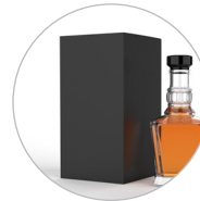
Liquor and Luxury Product Packaging