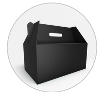
High Use Folding Carton Packaging