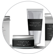
Secondary Cosmetic Packaging