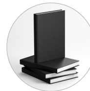
Soft and Hardbound Book Covers