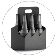
Consumer Goods Packaging