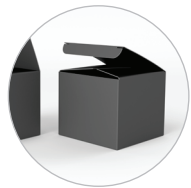
Folded Carton Packaging