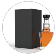
Liquor and Luxury Product Packaging