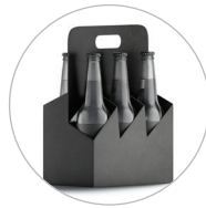
Consumer Goods Packaging